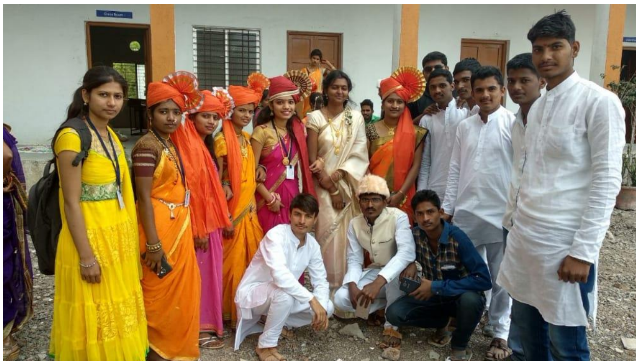
Students Celebration were Traditional