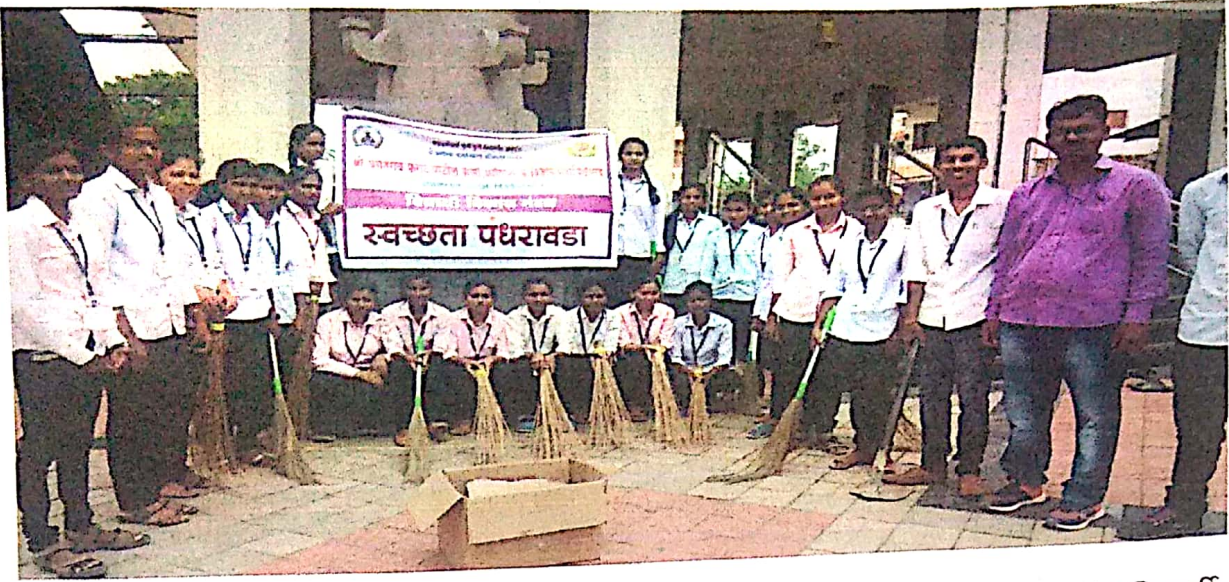
स्वच्छता पंधरवडा निमित्त मांडवगण फराटा येथील श्री वाघेश्वर मंदिर येथे स्वच्छता मोहिमेत सहभागी झालेले विद्यार्थी Students participating in a cleanliness drive at Sri Vagheshwar Temple in Mandavagan Pharata on the occasion of Swachhta fortnight