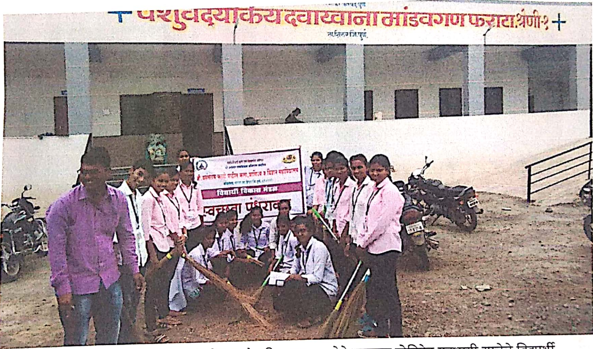
स्वच्छता पंधरवडा निमित्त मांडवगण फराटा येथील पशुवैद्यकीय दवाखाना येथे स्वच्छता मोहिमेत सहभागी झालेले विद्यार्थी Students participating in a cleanliness drive at Veterinary clinic in Mandavagan Pharata on the occasion of Swachhta fortnight.

Student Development Officer Shri Vasant Rao Pharate-Patil College Mandavagan Pharata, Tal. Shirur, Dist. Pune